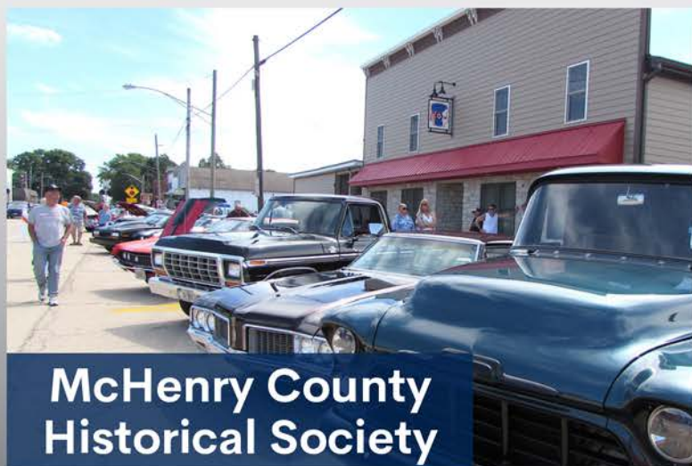
McHenry County Historical Society