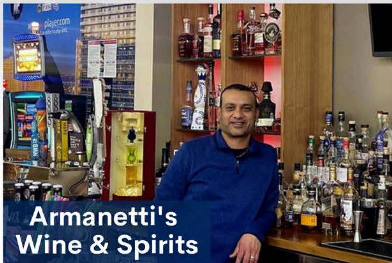
Armanetti's Wine & Spirits

We are proud of our community and the businesses we serve. So many of our customers work hard to give back, grow, and bring wealth to our community. To showcase their efforts, we have developed the Prairie Partner Program in which we highlight local businesses each month as a way to say Thank You for making Prairie your bank of choice and promoting excellence in our community.