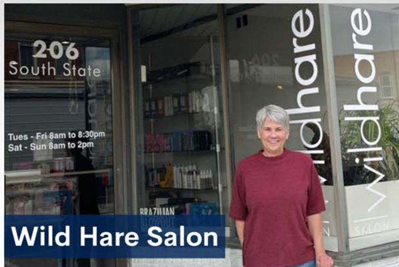
Wild Hare Salon