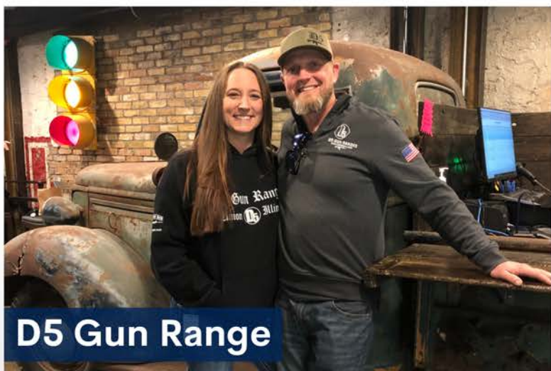
D5 Gun Range